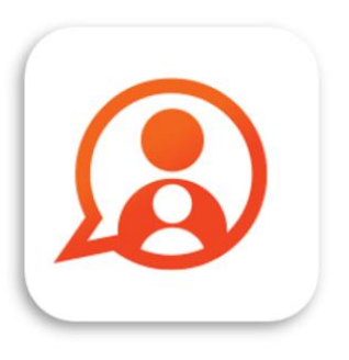
Konnect OuderApp Konnect B.V.

The URL and username will have been provided to you via e-mail. In the 'Password' field, you can input the password you have set with the link provided in the same e-mail.